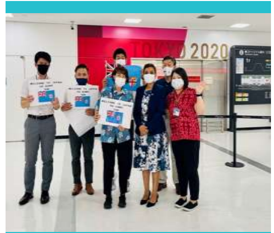
(above) FET and Oita City officials await Team Fiji Arrival, at Narita Airport, on 9 July 2021.